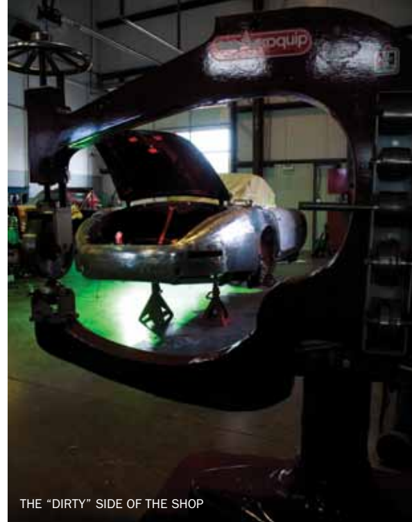
THE “DIRTY” SIDE OF THE SHOP